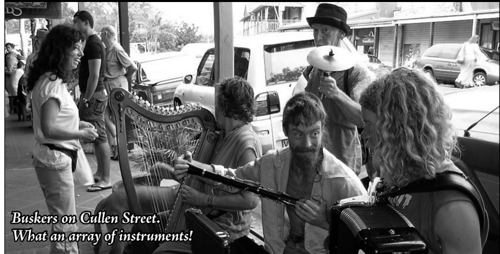
Buskers on Cullen Street. What an array of instruments!

All my best wishes of health, happiness, harmony and loving kindness for all.