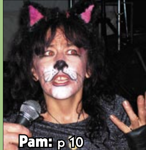
Pam: p 10