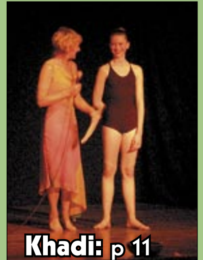
Khadi: p 11