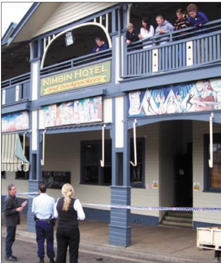
Inspector Glenn Gilbert addressing the regional media outside the cordoned off hotel, where guests were detained until mid-morning. The hotel remained closed to the public until forensic police completed their investigations in the afternoon.

The cameras installed after Council imposed a controversial special levy on businesses in the village zone amounting