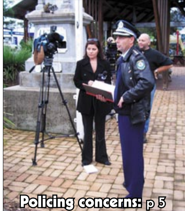
Policing concerns: p 5

the year. Detectives from Richmond Local Area Command are appealing for public assistance. Anyone with information about this robbery is urged to contact Lismore Detectives on (02) 6623 1599 or Crime Stoppers on 1800 333 000. If anyone sees the man they should call 000 immediately.