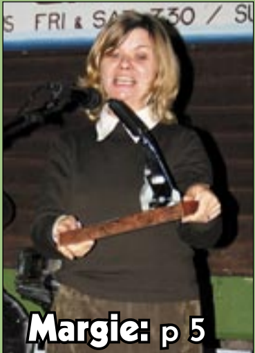
Margie: p 5