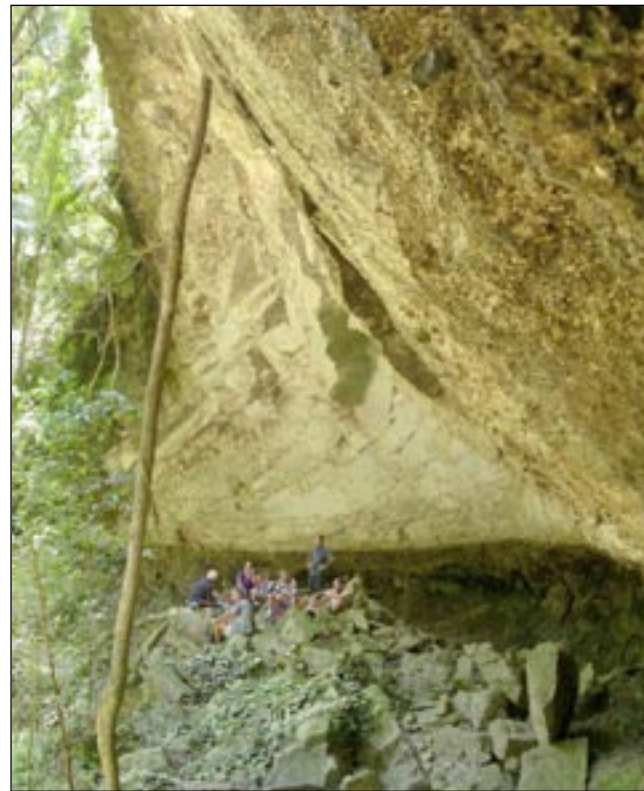
Discovery. Bushwalking Club members in a huge cave a couple of hundred metres downstream from the 'real' Mulgum Falls.

Membership fees are $25 per annum for individuals and $40 per couple - the bulk of that going to cover the cost of insurance and affiliation fees with the Confederation of Bushwalking Clubs of NSW. Our membership follows the calendar year January - December and is renewable by March. The membership of people joining after July