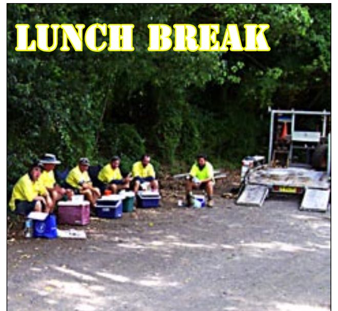
Lismore Council's bridge working team taking a lunch break at the Bush Theatre carpark while doing repairs to Cullen Bridge.

Their vigorous and demanding training schedules begin early next year in February, twice a week.