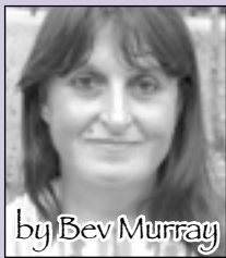
by Bev Murray

These dramatic individuals possess creative flair and style! There is an eternal childlike quality about their approach to the world, which can be very infectious. On the other hand Leo can be tantrum throwing and attention stalking! They are loyal in relationships and make fun-loving parents! If they can avoid the temptation of power for power's sake they make excellent leaders! Give them: A big party. Anything that oozes style, bold and expensive jewellery or an adventure holiday!