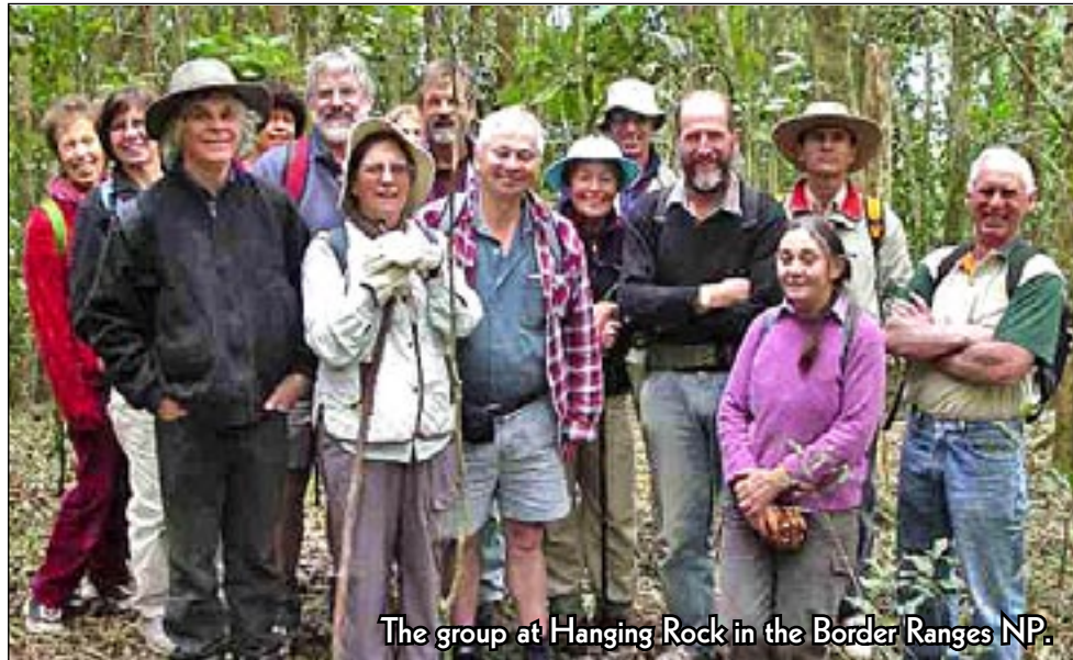
The group at Hanging Rock in the Border Ranges NP.

off track, steepish grades and a bit of lawyer vine. Nonetheless, all of us geriatric members of the club made it without difficulty, and with the great reward of some fabulous rainforest (it's quite different out there on the edge) and spectacular views:- along the escarpment to The Pinnacle; across space to Mount Warning and the coast beyond; to the Nightcap Range and beyond; to Lilian and Nimbin Rocks and beyond; out over the ranges to the west.