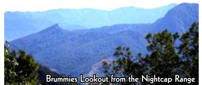
Brummies Lookout from the Nightcap Range

One interesting view on this walk was of Brummies Lookout - a tiny peak away in the distance. So, given the dramatic heights scaled in July, we decided on an August of easy walks.