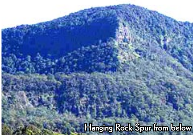
Hanging Rock Spur from below