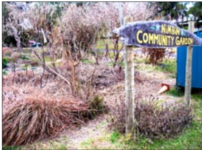
Devastation. Dead plants at Nimbin's community gardens in the aftermath of the July frosts.

People with gardens in low-lying areas along creeks are well aware of the frost problem and restrict most of their plantings to cold hardy species. Anything tender probably would have died years ago. However, people living in warmer, more elevated sites do not fully