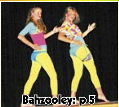
Bahzooley: p 5