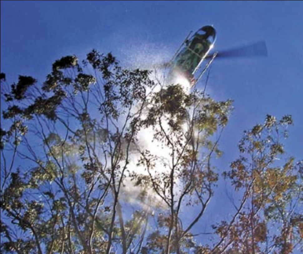
They can be used for good or evil. An RFS helicopter water-bombing a fire on Mt Nardi attended by a Nimbin crew earlier this year.