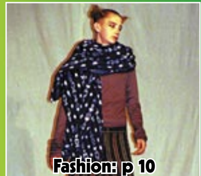
Fashion: p 10