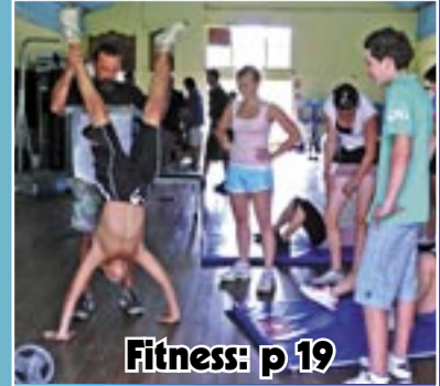
Fitness: p 19