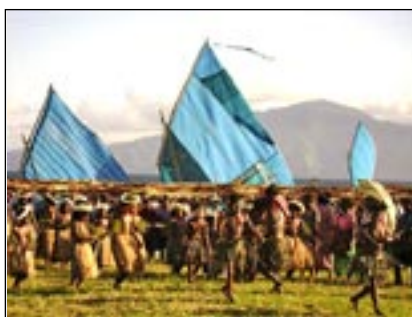
Woodlark Island people at a traditional ceremony (above) and their houses (left).

Woodlark Island presents a rare opportunity for business interests in PNG due to its legal status. Unlike Australia, 95% of land in PNG is traditionally owned. The Federal Government is therefore restricted to the remaining 5% for revenue from resource development. During colonial times the crown took possession of the majority of Woodlark Island for the state. Currently 6 years remain on the 99 year lease. Islanders have been calling for its return to traditional ownership after the lease expires. A brief window exists for the PNG Government and business interests to gain full benefit from Woodlark's natural resources without consent from the local community.