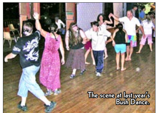
The scene at last year's Bush Dance.

Get your dancing shoes on, it's time for the annual Bush Dance at Tuntable Community Hall to herald in the festive season, on Saturday 15th December.