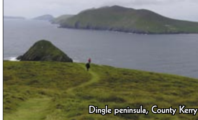
Dingle peninsula, County Kerry