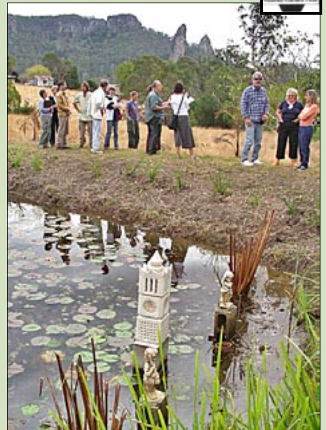
Nimbin Garden Club members at Mac and Chris's place

Although the sun stayed away for the afternoon of the meeting, the following week of long-awaited rain has provided much needed relief for Nimbin's gardeners. Many local properties have reported falls in excess of 230 mm spread over an eight day period. With the consensus being that the frosts are now finished, its time to get out and plant up big for spring, summer and autumn.