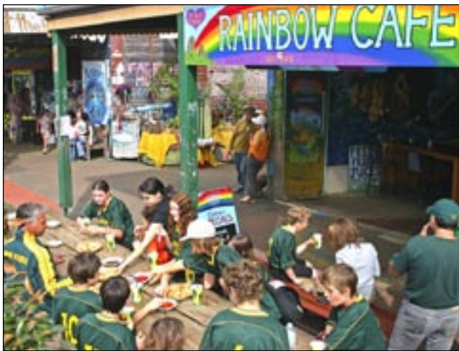
Team spirit. Headers 15s boys team enjoying post-season smoothies and wedges from their sponsor, the Rainbow Café.

The Headers keep trying for a third. Alstonville are desperate for an equalizer, but don't have the depth of talent of the Nimbin Squad. Alstonville go for goal It bounces around in the mouth, and is finally sent down the other end of the paddock, to end the thrilling semi-final. Well done.