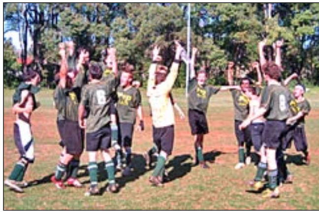
Confident. Headers 5ths break their huddle with a war-cry before the semi-final at Alstonville