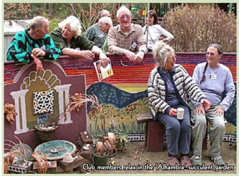
Club members relax in the 'Alhambra' succulent garden