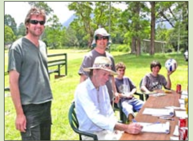
All ages A rare quiet moment for the sign-on desk at the Headers Field. Logo comp closes 14th March.

Early season training for all grades is on Thursdays after school, while those