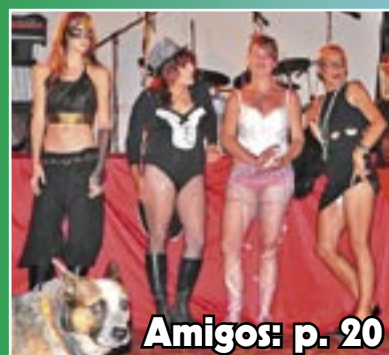
Amigos: p. 20