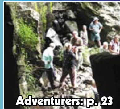
Adventurers: p. 23