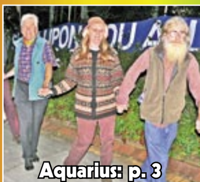
Aquarius: p. 3