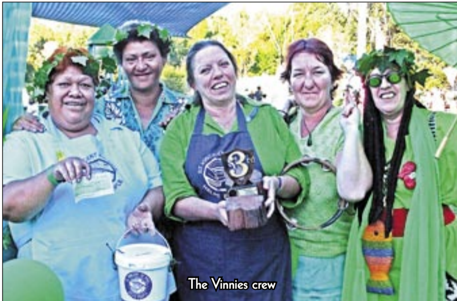
The Vinnies crew

Several community groups were recipients of the proceeds of the Saturday night doof. This year $2000 in donations has been split between the Hospital, Skate Park, Rainbow Ridge Steiner School, Blue Knob and Nimbin Volunteer Rural Fire Brigades.