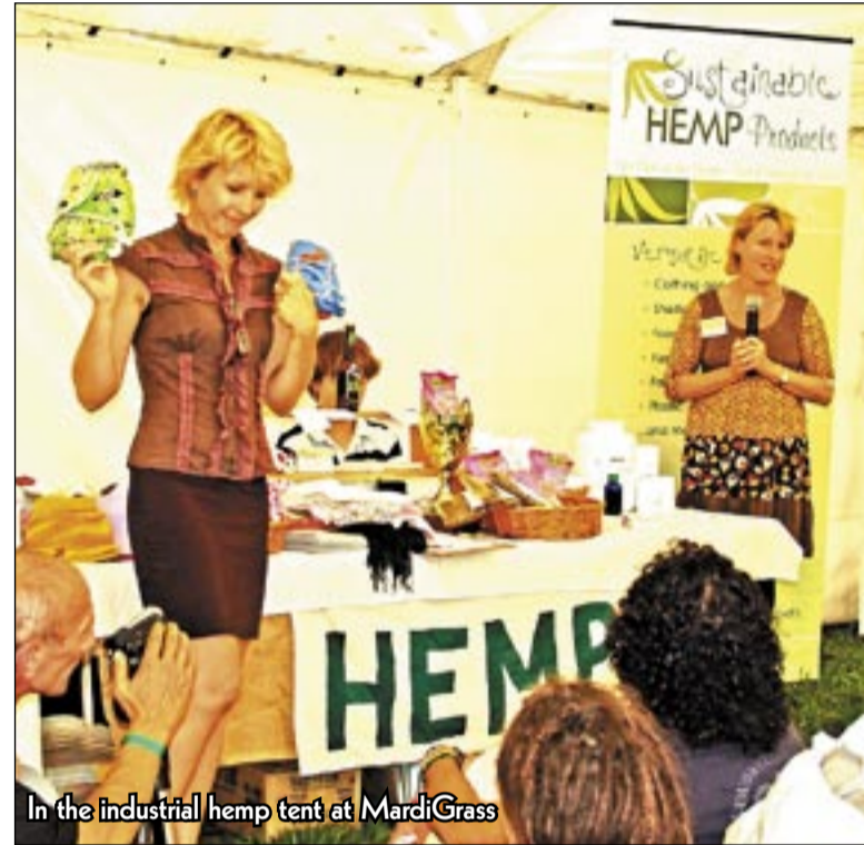
In the industrial hemp tent at MardiGrass

Please RSVP to Ecotechnology Australia on 6621-5123.