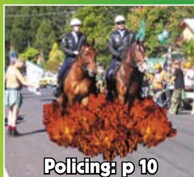
Policing: p 10