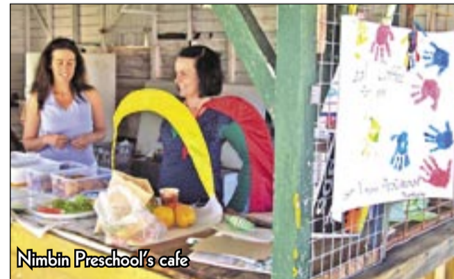
Nimbin Preschool's cafe

The revenue really helps these small, tireless community groups, so it's odds-on that they'll be lining up to do it all again next year.