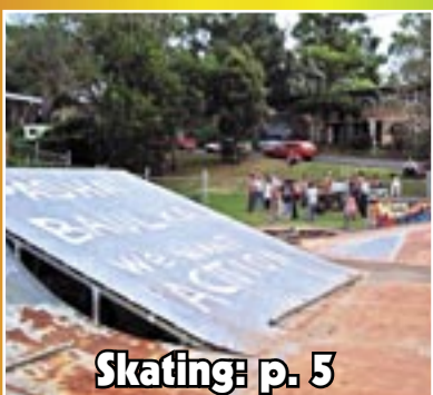
Skating: p. 5