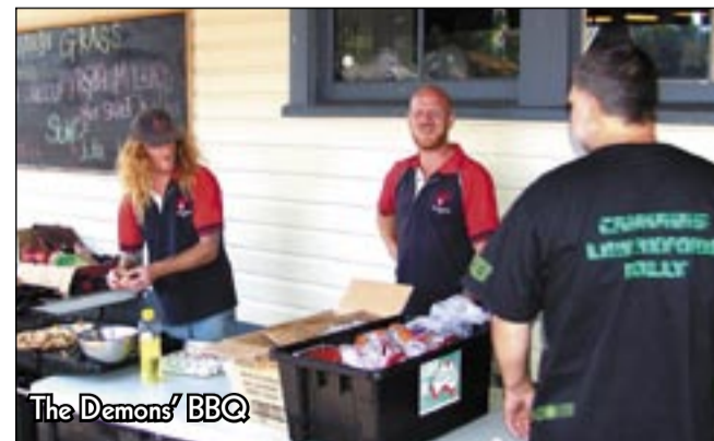
The Demons' BBQ