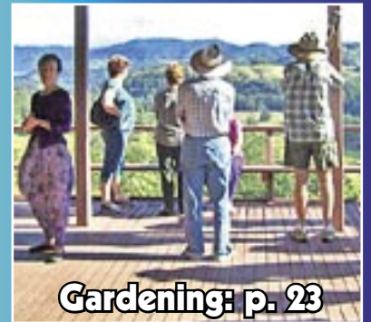
Gardening: p. 23