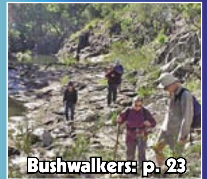
Bushwalkers: p. 23