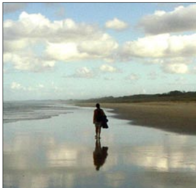
Inspiration from poetry and prose Blue Knob Hall Gallery, Lillian Rock August 7 - October 5, Thursday to Sunday, 10am to 4pm

Poetry and literature have long inspired the visual arts. Yet, at the dawn of history, language, poetry and literature began as strings of little pictures - pictographs. In turn, great images have inspired poetry and literature.