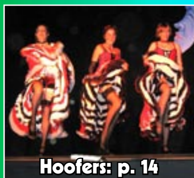
Hoofers: p. 14