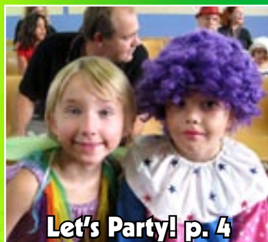
Let's Party! p. 4