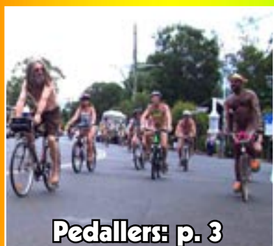
Pedallers: p. 3