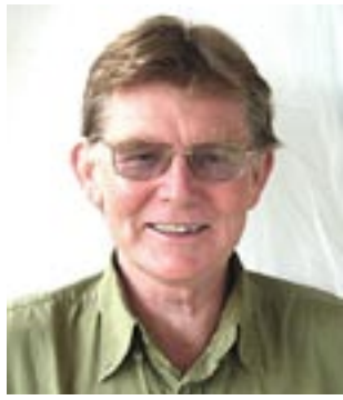
by Lismore Councillor Simon Clough

How things change in a month. Last month's column opened with "It was great to have all that rain and no serious flood". Today I've changed my mind – it's great to have that glorious Autumn sunshine, and what a helluva flood we've just had.