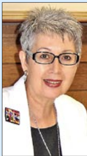
by Jenny Dowell Mayor of Lismore

It's a shame that the public meeting to discuss the development was on such a miserable evening with few venturing out in the rain (including me).