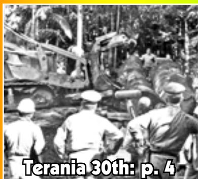
Terania 30th: p. 4