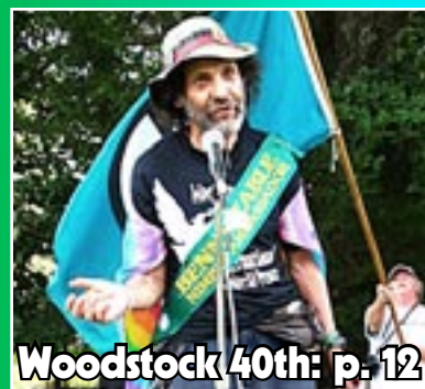
Woodstock 40th: p. 12