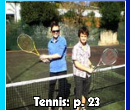
Tennis: p. 23