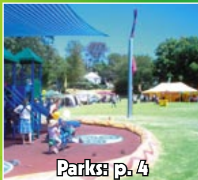
Parks: p. 4