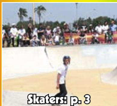
Skaters: p. 3