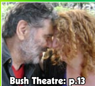
Bush Theatre: p.13