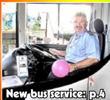
New bus service: p.4