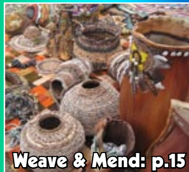
Weave & Mend: p.15