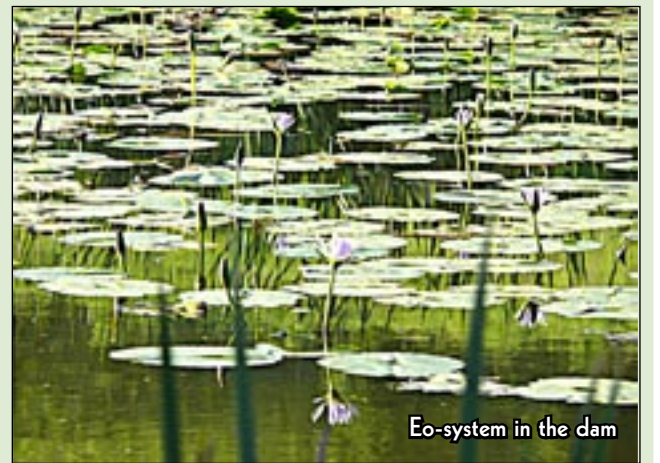
Eo-system in the dam