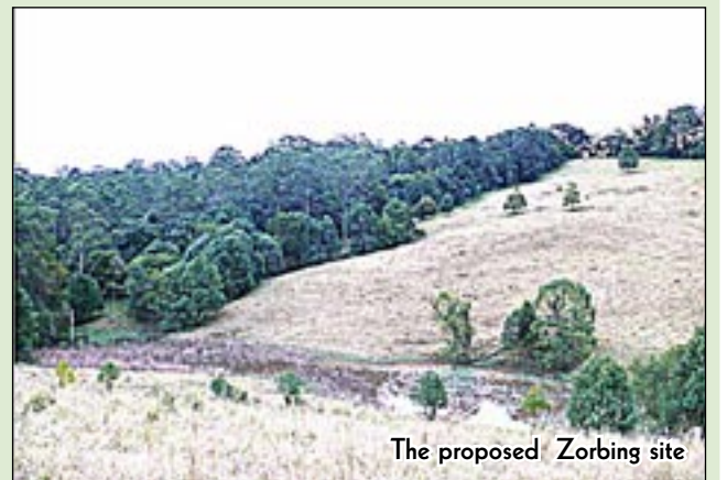
The proposed Zorbing site