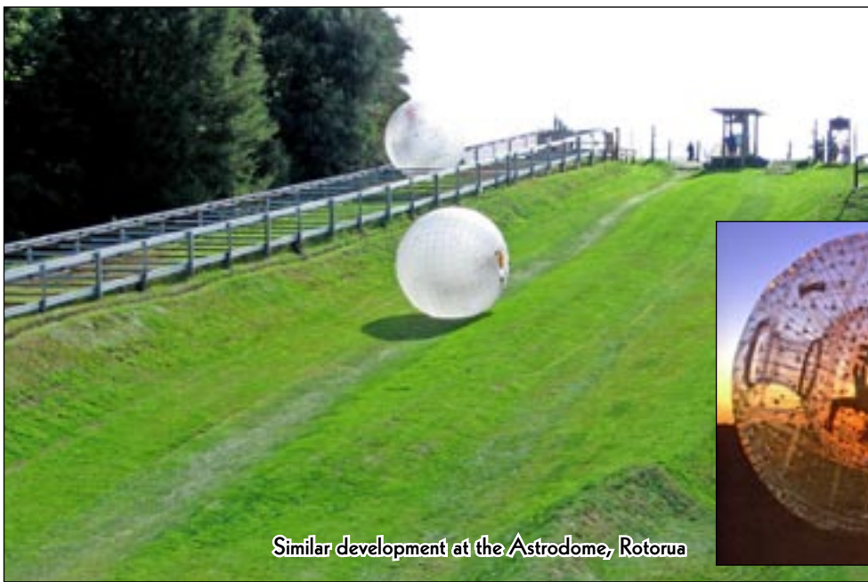
Similar development at the Astrodome, Rotorua