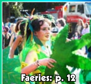
Faeries: p. 12