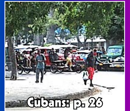
Cubans: p. 26