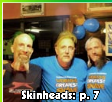
Skinheads: p. 7