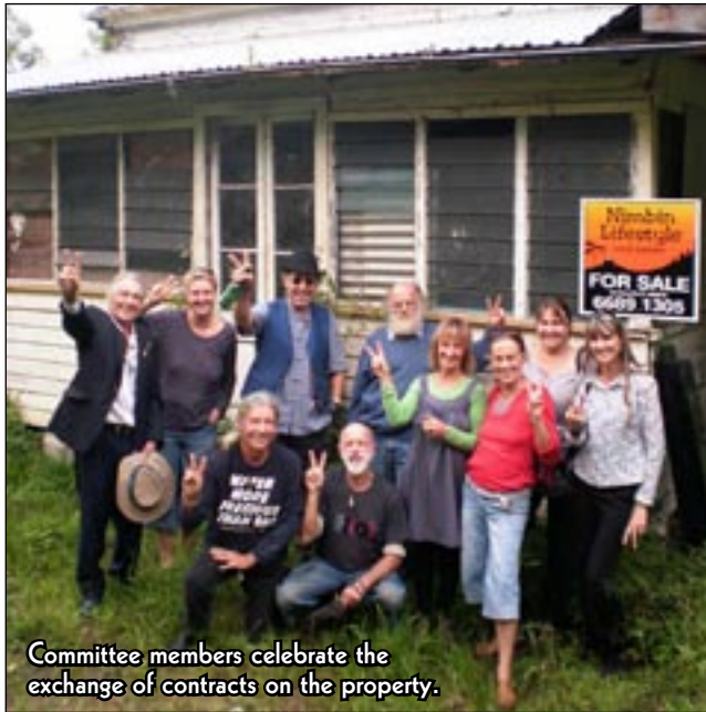
Committee members celebrate the exchange of contracts on the property.

"The loan will be interest free until December 2012 and our aim is to repay the