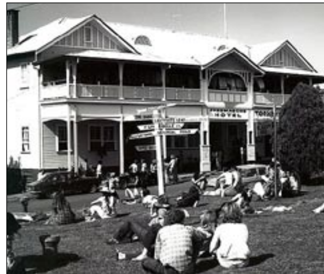
Allsopp Park during the 1973 Aquarius Festival.

Please like our page and pass it on to your friends.