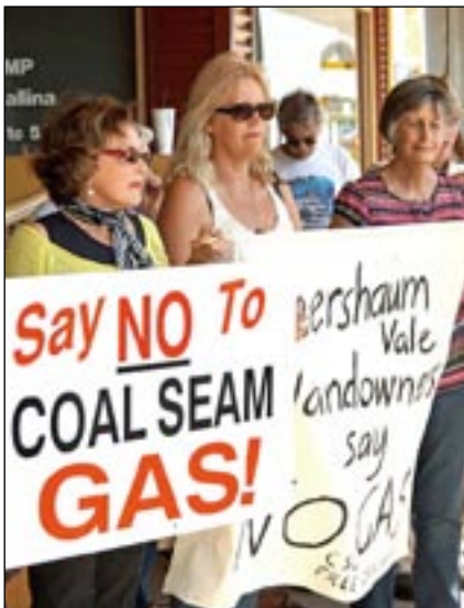
Protest outside the Ballina office of Don Page MP, Minister for the North Coast.