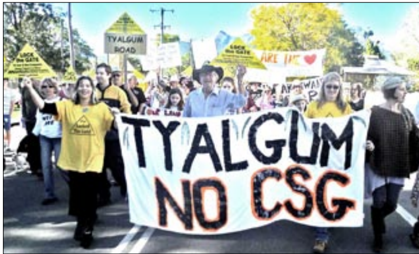
Protest rally in Tyalgum, the first community in the Tweed to go gasfield-free.

"Recent announcements by the NSW state government do not give communities any confidence that they are actually listening to the people they