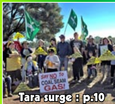
Tara surge : p.10