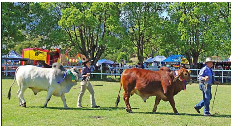
by Dave Fawkner

The 94th Nimbin Show kicks off the school holidays on 20th and 21st September with lots to see and do for young and old.