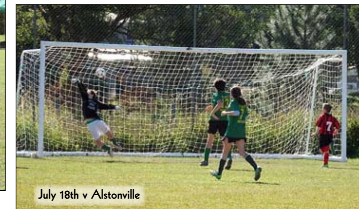
July 18th v Alstonville