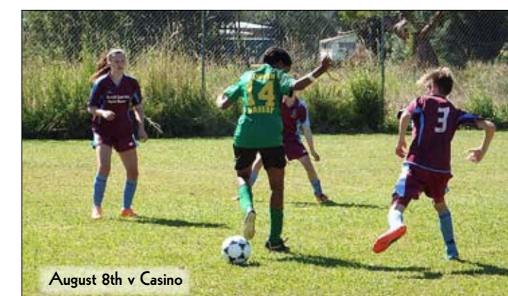
August 8th v Casino