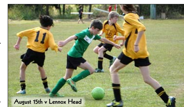
August 15th v Lennox Head