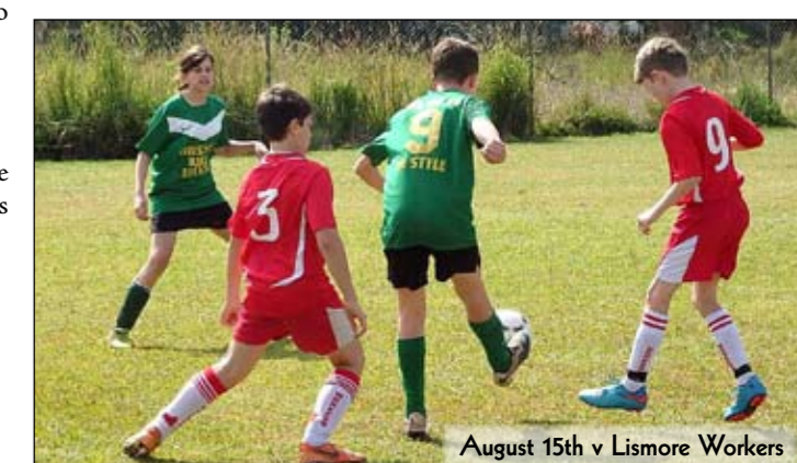
August 15th v Lismore Workers