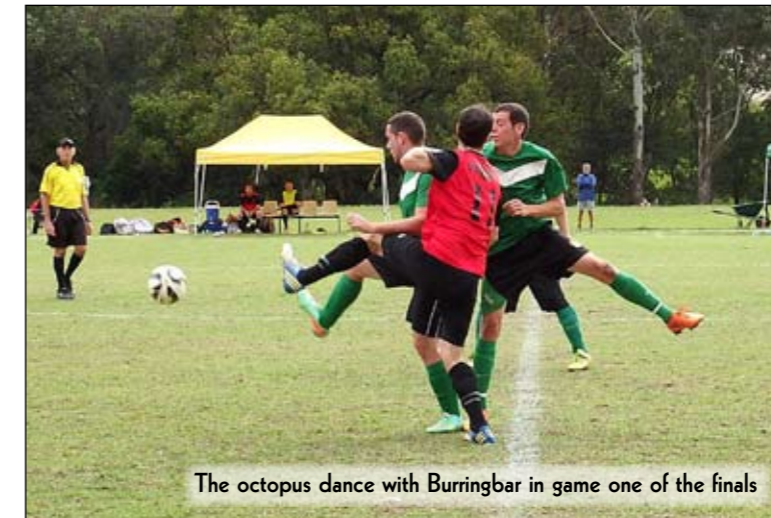
The octopus dance with Burringbar in game one of the finals

Headers have a corner, the ball comes in and is just tipped away from goal by the keeper and that ends the first half.