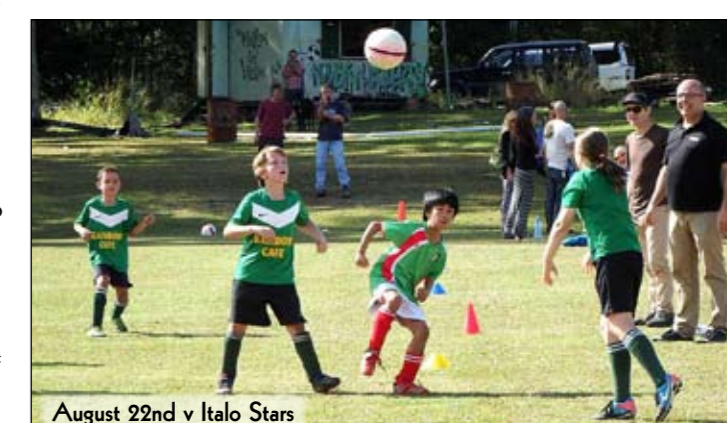
August 22nd v Italo Stars