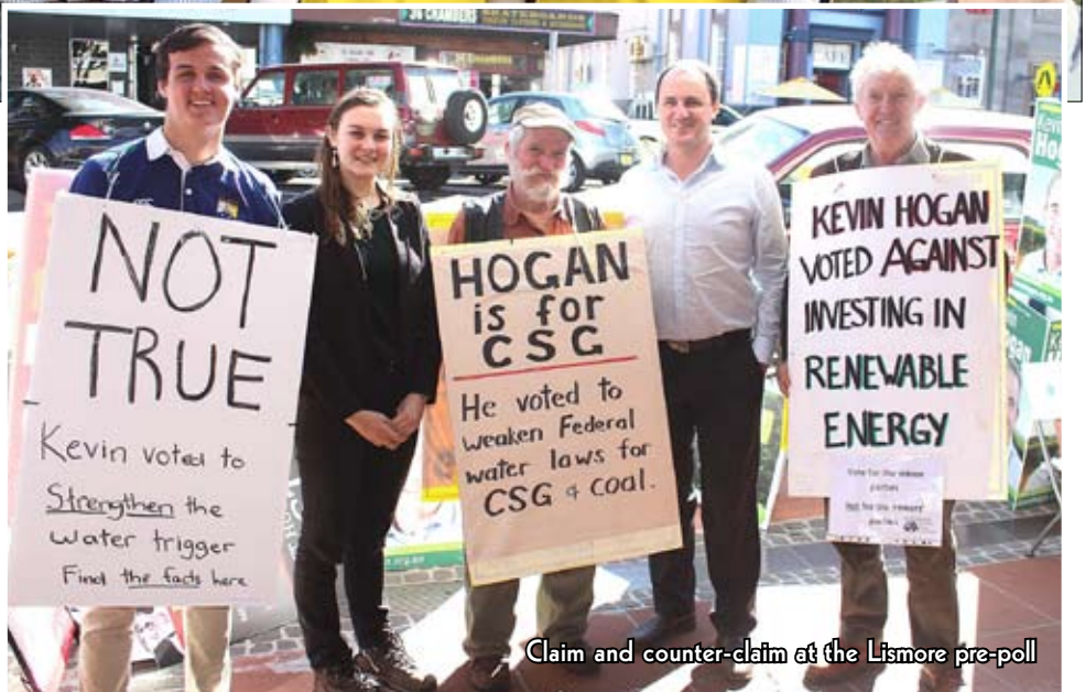
Claim and counter-claim at the Lismore pre-poll