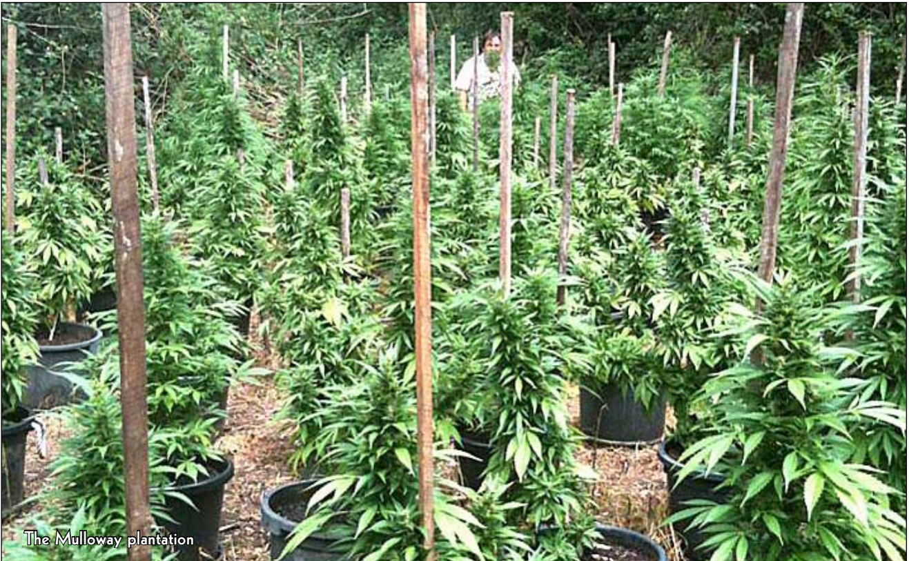
The Mulloway plantation