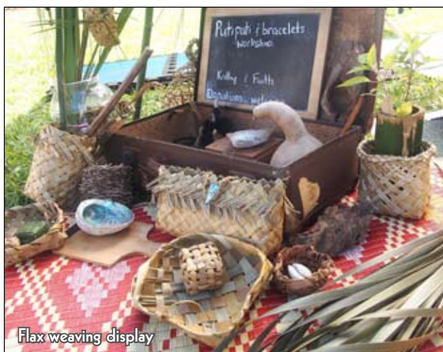
Flax weaving display

Planning for next year's Festival at Djanbung Gardens is underway.