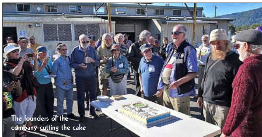
The founders of the company cutting the cake