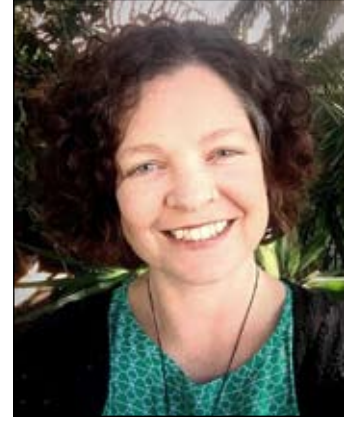
Word of the Bird by Cr Elly Bird

Climate change, water, energy and food security are such important issues of inter-generational equity; it saddens me that so many of our so-called leaders refuse to be brave enough to stand up and make a