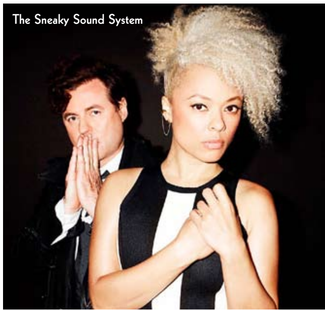
The Sneaky Sound System

This competition is open to all musicians whether from