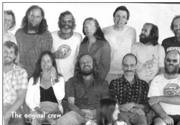
The original crew