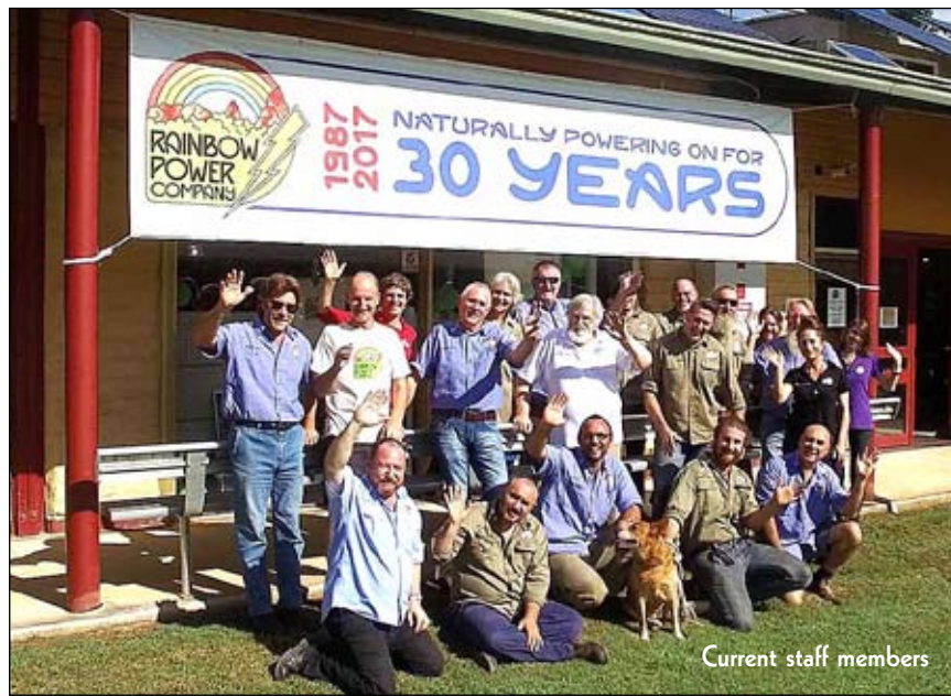
Current staff members