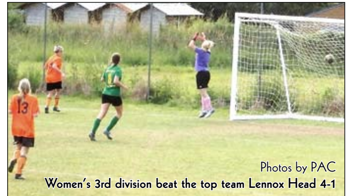
Women's 3rd division beat the top team Lennox Head 4-1