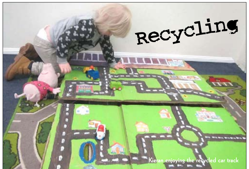
Kieran enjoying the recycled car track