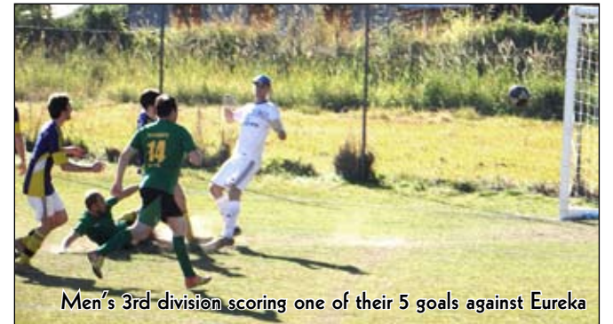
Men's 3rd division scoring one of their 5 goals against Eureka

A month of some great wins for the Nimbin Headers teams: • Women's 4th div have had 4 wins in July. • Women's 3rd div have had 2 wins, 1 loss and a bye. • Men's 1st div have had 1