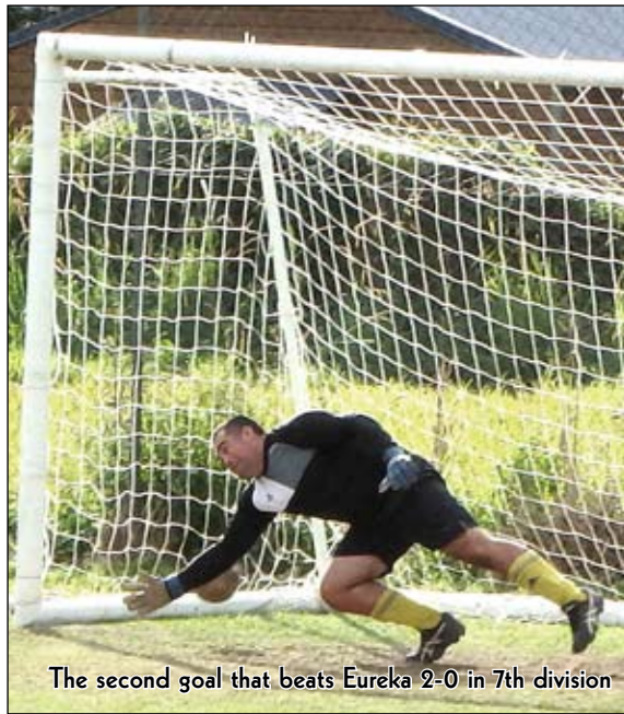
The second goal that beats Eureka 2-0 in 7th division