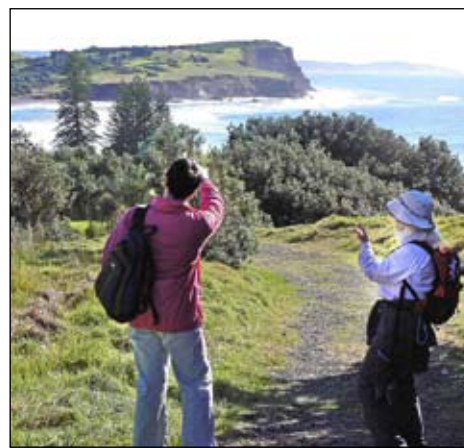
On the trail to Evans Head (above)