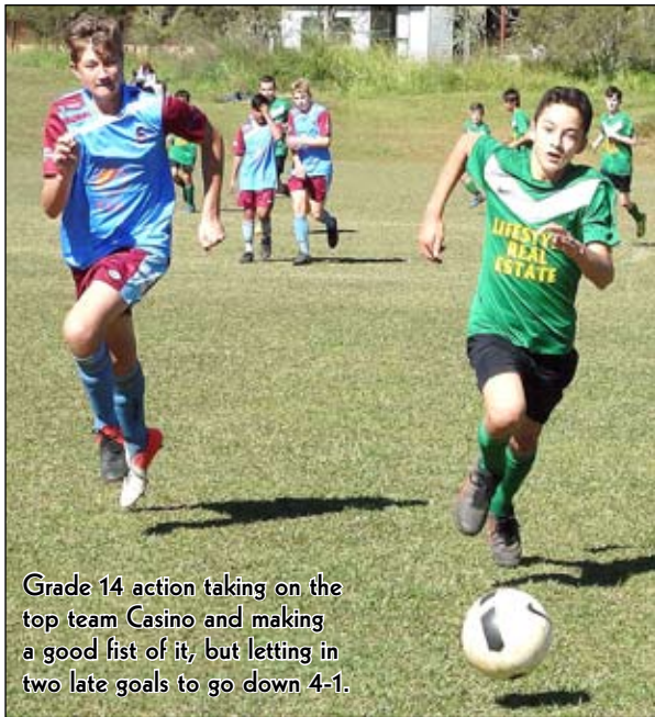
Grade 14 action taking on the top team Casino and making a good fist of it, but letting in two late goals to go down 4-1.