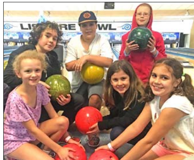
Wet weather sports gathering in Lismore

I attended this conference last year in my volunteer role with the Home Education Association and loved connecting with so many parents who are