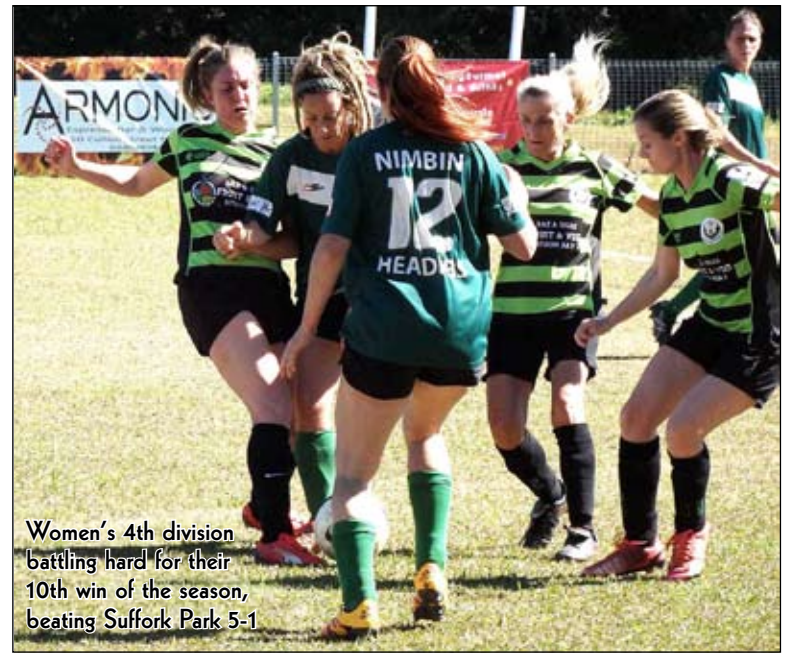
Women's 4th division battling hard for their 10th win of the season, beating Suffork Park 5-1