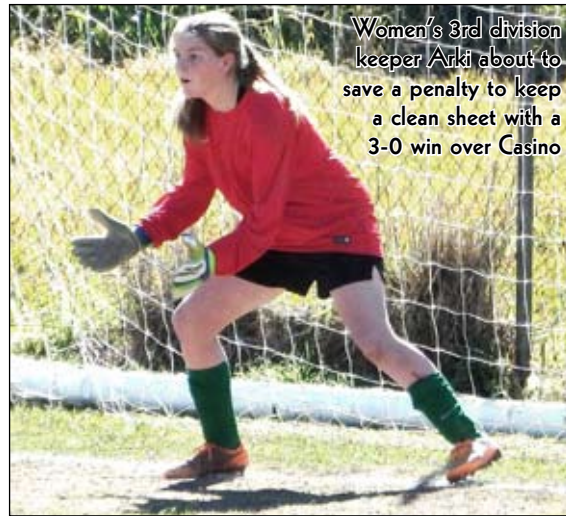
Women's 3rd division keeper Arki about to save a penalty to keep a clean sheet with a 3-0 win over Casino