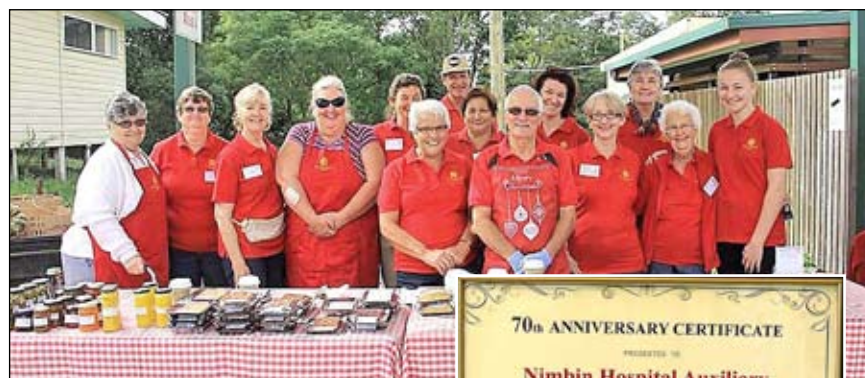
Nimbin MPS Auxiliary 'Red Brigade' at their fundraising stall

From 1st July 2016, the local Auxiliary have purchased the following items for their MPS: bladder scanner, lifter with scales (rifton tram), spirometer, mobile examination light, three electric recliner lift chairs, two ROHO adjustable cushions and a comfort chair, curtain flick sticks, power assist for wheelchair, all day lifter sling. The residential aged care facility has been provided with new curtains, two lounge suites, six cushions and a desk. Auxiliary members always deliver chocolates at Christmas time to residents.