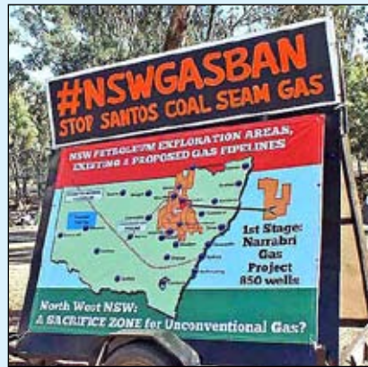
Farmers in the Pilliga (left) and the Santos CSG debacle

bed formed the venue for a human NO CSG sign-each letter took about 67 people to form: (pictured, top) a great turnout. 20 Northern Rivers folk were there supporting the occasion. If you're interested in this issue, come and talk to us at the Nimbin Environment Centre.