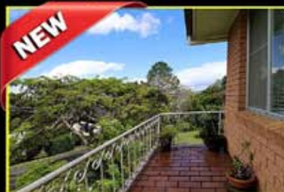
20a Irwin Street, Kyogle $270,000 * Value for money! Elevated treelined street close to town. Well built 3 + bed home. Huge outdoor entertainment area. Garage