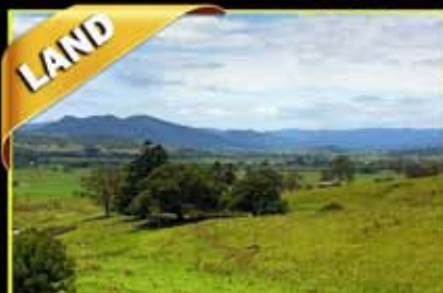
62 Collin Street, Kyogle $135,000 * One of best views - walk to Kyogle Village. Elevated almost 4,000m2 block at end of No Through Road. Fully serviced

As well as being a registered Real Estate Agent, Klaus is a true local who has served the community as a plumber and waste water consultant for many years. Having expertly renovated & built homes, Klaus understands all aspects of the property market "Dedicated to helping you achieve your property dreams"