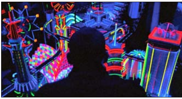
Enter the Void

Principal photography took place on location in Tokyo, and involved many complicated crane shots and computer-generated imagery. The film's soundtrack is a collage of electronic pop and experimental music. This is a deep trip into the afterlife and an psychedelic exploration of the realms of the dead. A special experience and a visual masterpiece.