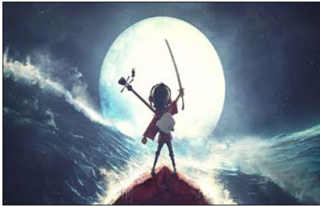
Kubo and the Two Strings