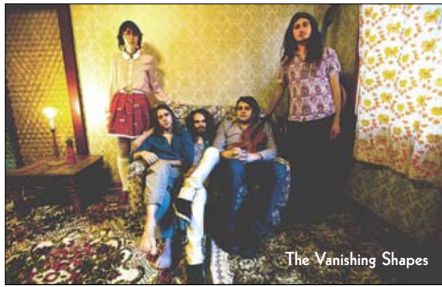
The Vanishing Shapes