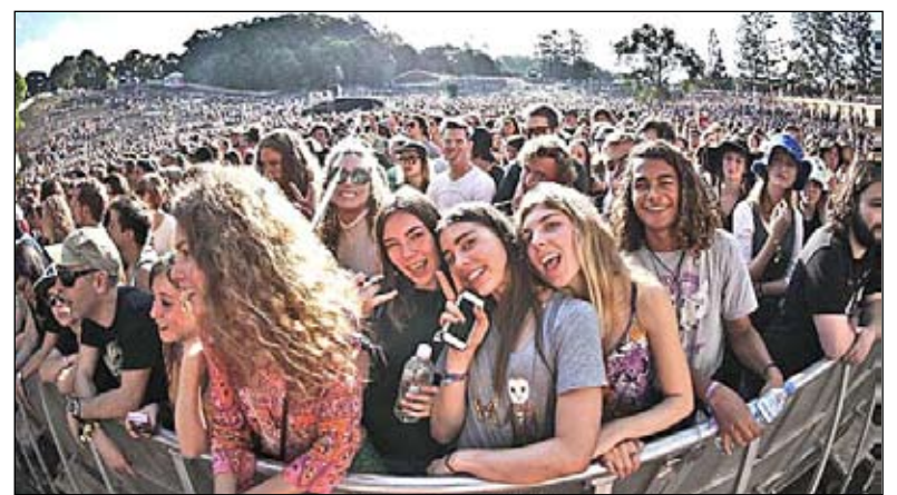
Music festivals such as Splendour in the Grass have had social and ecological impacts on the Byron Parklands site for five years now.

The NSW government spent millions of dollars establishing Billinudgel Nature Reserve and the Wildlife Corridor but they appear uninterested in protecting that investment. The Department of Planning has not provided rigorous oversight of compliance with the consent conditions. Self-monitoring