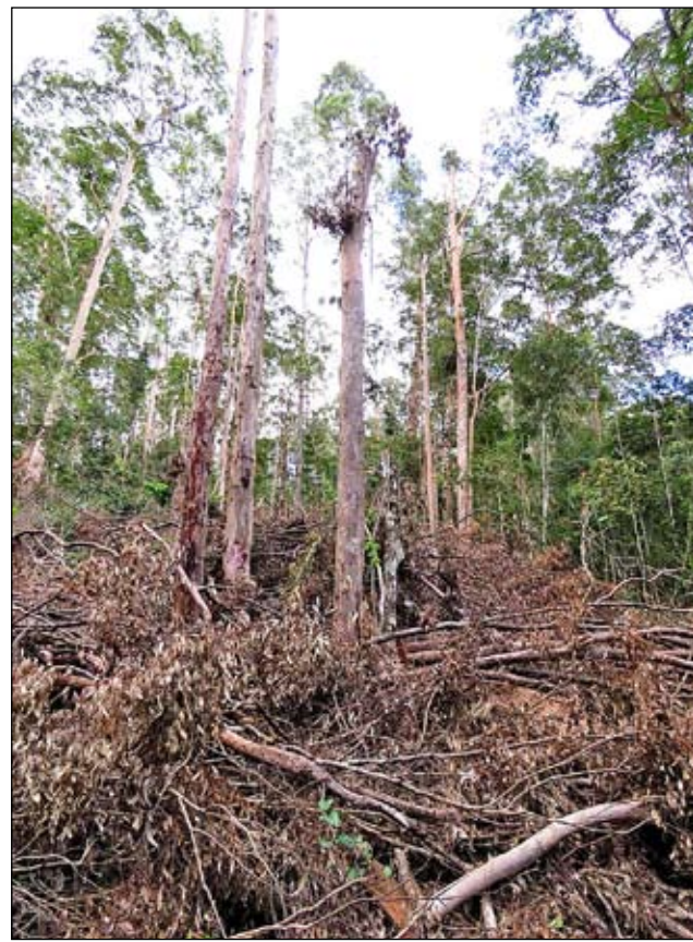
Roading in the EEC Lowland Rainforest and logging in the EEC Grey Box-Grey Gum wet sclerophyll forest

of logging laws in Cherry Tree State Forest involving illegal logging of hundreds of habitat trees, damaging threatened plants, logging within stream buffers, and failing to drain roads.