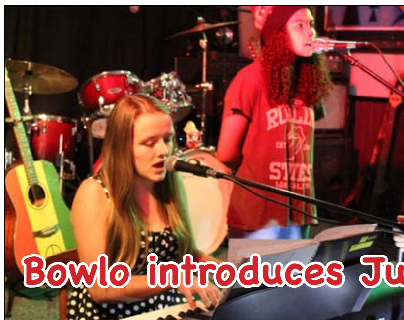
Bowlo introduces Junior Mic

So get writing and recording (a simple video recorded on a mobile phone will do) or send your already themed song in to the Play Mullum 'Celebration' Songwriting Competition for your chance to win a 30-minute performance at the festival on Sunday 19th November and two festival passes. Entries close Friday 27th October. Bands and individuals can apply. Head to: mullummusicfestival.com for full details and application forms.