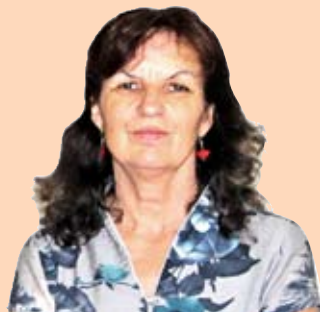
by Brigid Beckett

Acupuncture and specific herbal formulas are very effective at tonifying yin and relieving these symptoms as the body finds a new balance. Although yin deficiency frequently is the predominant pattern, yin deficiency can occur at the same time, as both kidney yin and yang decline together. Therefore sometimes a formula tonifying both is required. The hormone oestrogen in yin, while progesterone is yang.