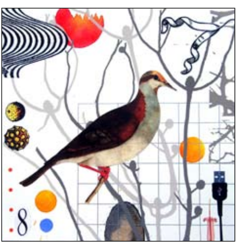
'Encroachment #8' by Jenny Kitchener