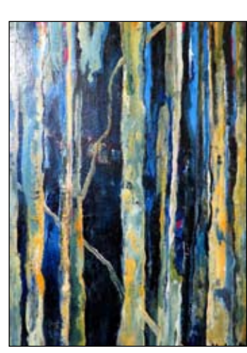
'The Cabin' by Maureen Whittaker