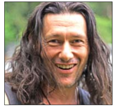
by Cameron Storey

The University of South Florida found that low doses of the psilocybin repairs brain damage caused by extreme trauma, offering renewed hope to millions of sufferers of PTSD (Post-Traumatic Stress Disorder). This study confirms previous research by Imperial College London, that psilocybin, stimulates new brain cell growth and erases frightening memories.