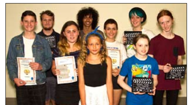
Happy Winners from the 2017 Nimbin Youth Film Festival For information visit: www.nimbinyouthfilmfestival.com

Support our budding directors and come down and check out the talent. Cafe open.