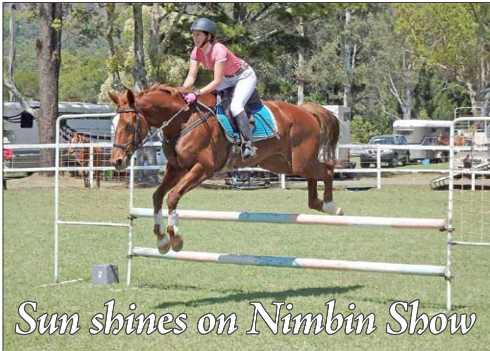
Sun shines on Nimbin Show

81 Cullen Street Nimbin 2480 Phone 6689-1148 nimbin.goodtimes@gmail.com