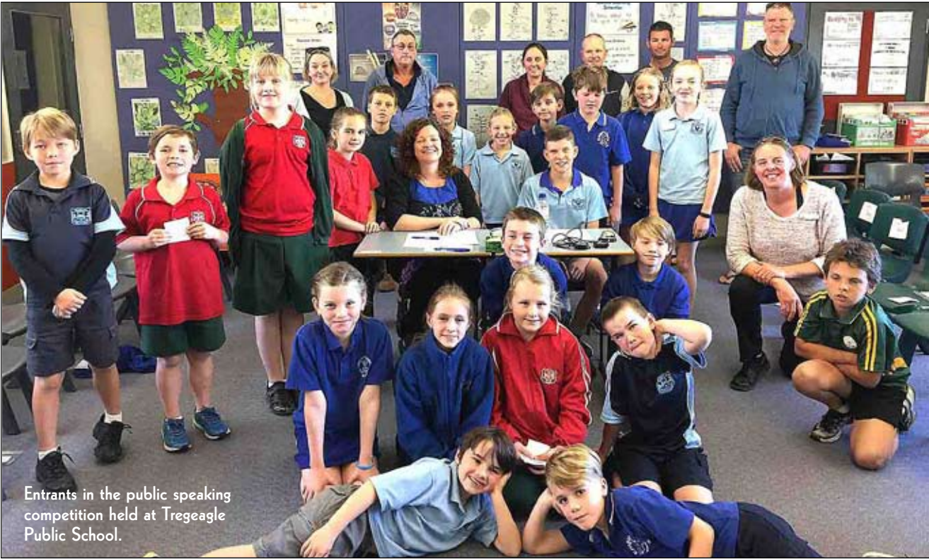
Entrants in the public speaking competition held at Tregagle Public School.

Nurse to patient ratios reduce errors, improve the amount of time each nurse can spend on patient care, create better workplaces, reduce stress and lead to higher retention of nurses and midwives.