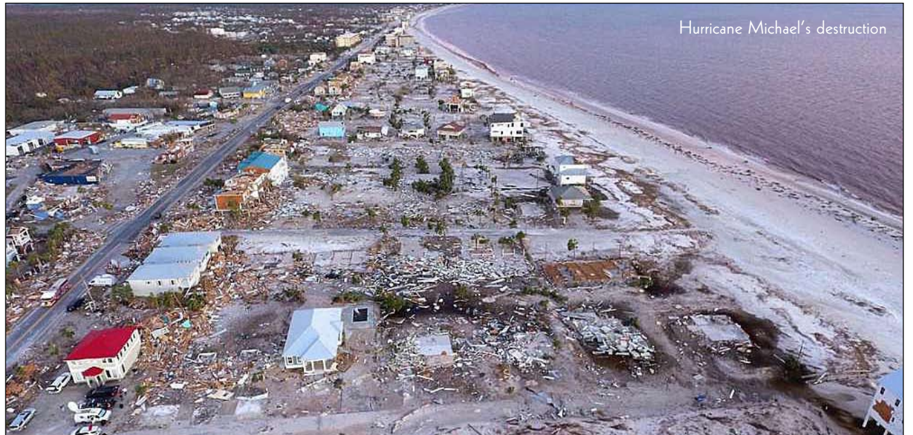
Hurricane Michael's destruction

The Union of Concerned Scientists knows that limiting global warming in the decades to come is