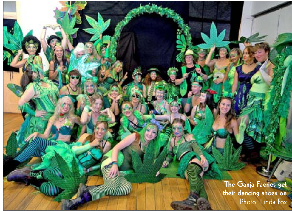
The Ganja Faeries get their dancing shoes on

It's hard to argue, also. Drug driving sounds so dangerous. Like drunk driving. And yet it's totally different. They just haven't been able to sort drug testing like they have alcohol testing. It's a whole different ball game, and the people making the rules I suspect don't have