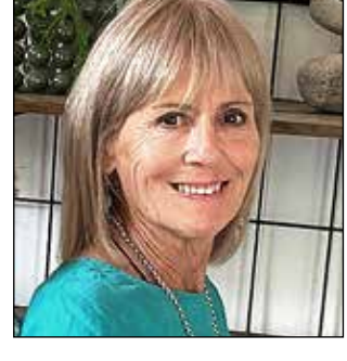
by Auralia Rose

Often disappointment and frustration was the result, when our efforts didn't produce the desired outcome, or we were only partially successful. Why doesn't it work for me, we asked