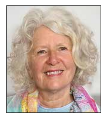
by Sonia Barton

Chronic stress disrupts nearly every system in your body. It can suppress your immune system, upset your digestive and reproductive systems, increase the risk of