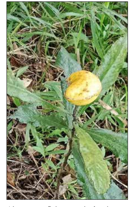
Native guava, Bolwarra can be found among the weeds, so identification is important

Bush regeneration is a rewarding activity. Remove weeds and the natives bounce back where there is a sufficient seed bank. Nature does not often