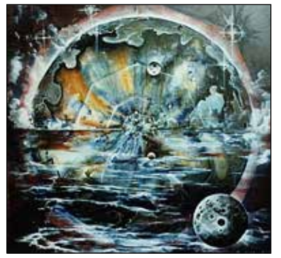
Inner worlds and gold fusion