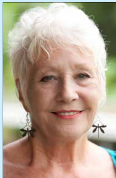
by Tonia Haynes

Stress, injury, viruses, parasites and medications can all have a negative effect on the working of the valves,