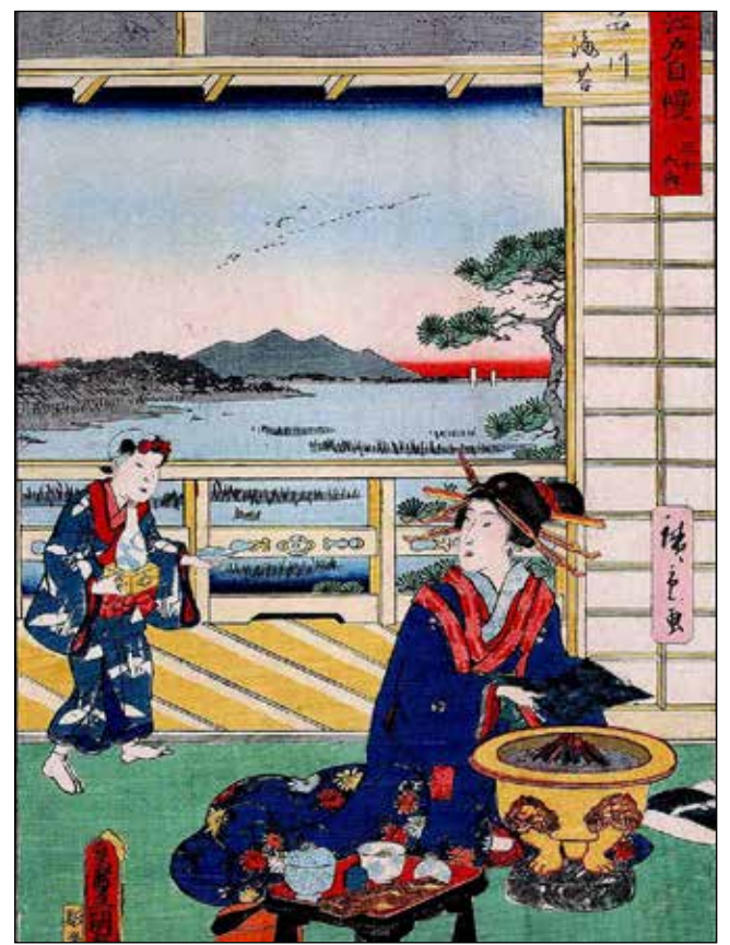
Above: Traditional nori preparation Below: Seaweed cultivation

1 tbs toasted white sesame seeds 1 tbs toasted black sesame seeds ½ sheet of nori ½ tsp chilli powder ½ tsp salt flakes pinch caster sugar 1 dried shiitake mushroom, finely grated