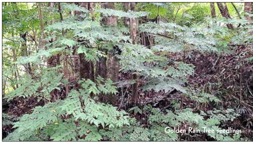
Golden Rain Tree seedlings

Easter is here and so is Easter Cassia, Senna pendula var. glabrata . With happy yellow flowers, this rampant sprawling shrub lights up the roadsides and the creek banks. It can invade the understory of regenerating forests and dominate