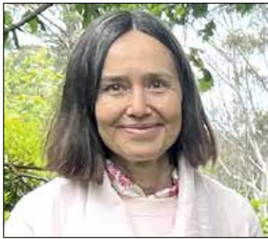
by Antionette Ensby

Reverse your perspective by recognising the problem as a means of finding a solution. Don't look at the threat but at the opportunity. The psychology behind hope is the opening of pathways for personal