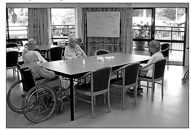
Welcoming. The lounge-dining room at the Hospital's aged-care

There is also an opportunity for local musicians to show their support for the aged-care facility by participating in