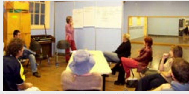
Pros and cons. A view of the meeting held to discuss the ownership of Peace Park.

This is a complex and technical issue, but bear with me, it's important, because it highlights the Nimbin community's ability to conduct its own affairs, as well as its relationship with Lismore Council.