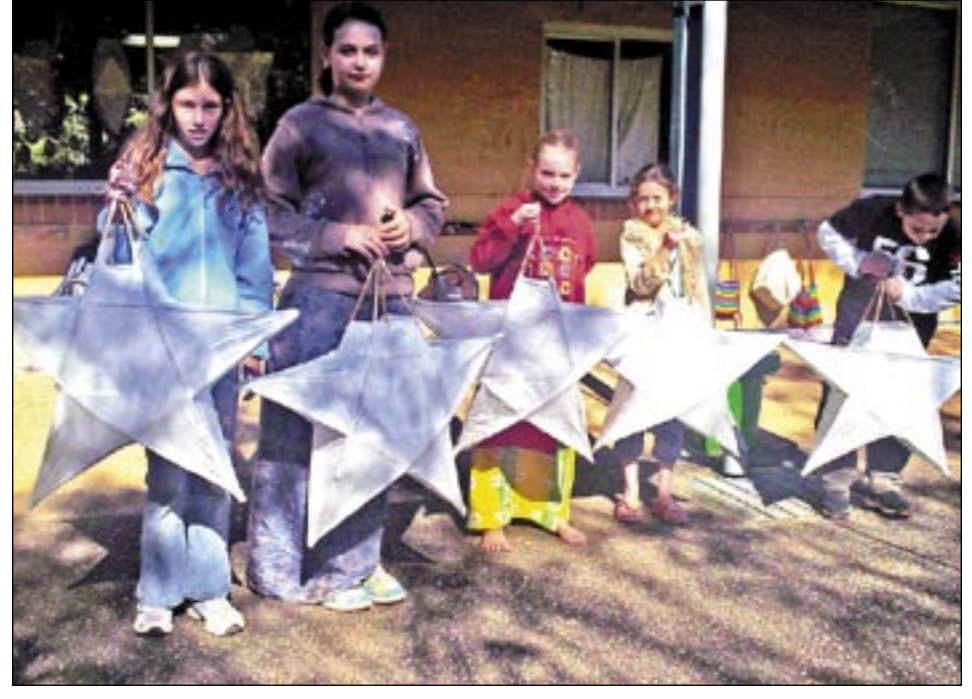
Primary students at Nimbin Central School are doing lantern-making workshops.

There was a very happy buzz in the air all day, and surely no-one will forget this special occasion. The feedback from parents, ex-students, teachers and students was so overwhelmingly positive that a repeat next year seems to be a must.