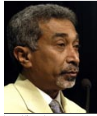
Mari Alkatiri, 'economic nationalist'.

authority on the law of the sea, "is like acquiring stuff from a thief ... the fact is that they have neither historical, nor legal, nor moral claim to East Timor and its resources." Beneath them lay a tiny nation then suffering one of the most brutal occupations of the 20th century. Enforced starvation and murder had extinguished a quarter of the population: 180,000 people. Proportionally, this was a carnage greater than that in Cambodia under Pol Pot. The United Nations Truth Commission, which has examined more than 1,000 official documents, reported in January that Western governments shared responsibility for the genocide; for its part, Australia trained Indonesia's Gestapo, known as Kopassus, and its politicians