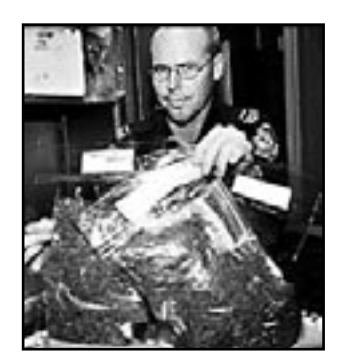
The haul. In police custody.

Police conducted 383 random breath tests