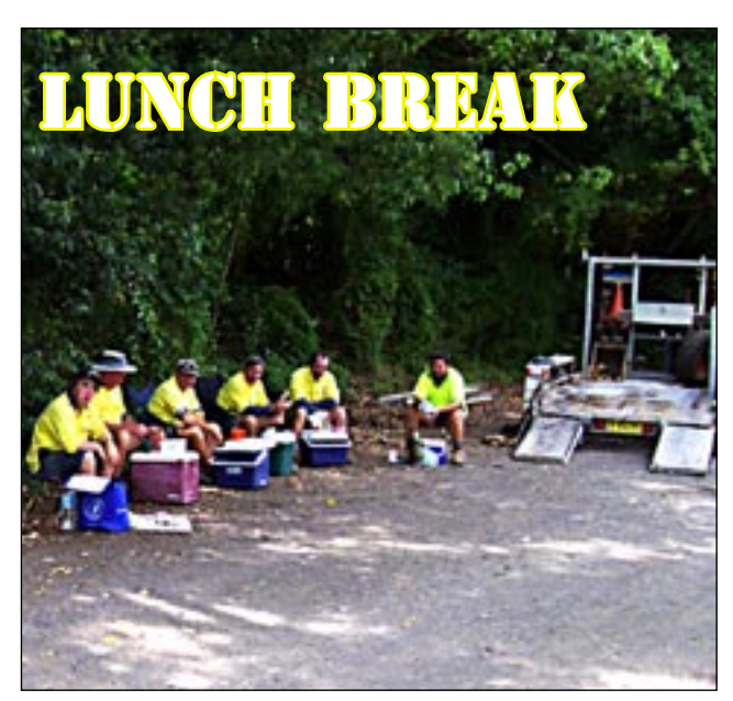
Lismore Council's bridge working team taking a lunch break at the Bush Theatre carpark while doing repairs to Cullen Bridge.

Their vigorous and demanding training schedules begin early next year in February, twice a week.