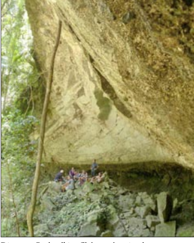
Discovery. Bushwalking Club members in a huge cave a couple of hundred metres downstream from the 'real' Mulgum Falls.

Membership fees are $25 per annum for individuals and $40 per couple - the bulk of that going to cover the cost of insurance and affiliation fees with the Confederation of Bushwalking Clubs of NSW. Our membership follows the calendar year January -December and is renewable by March. The membership of people joining after July