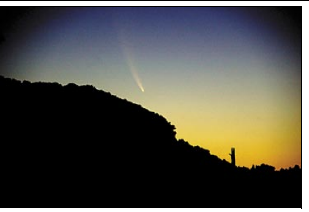
Cosmic. The comet going down over Mountaintop at twilight on 22nd January.