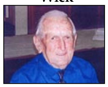
19th February 1921 – 22nd September 2007 Much loved by the Nimbin community Rest in Peace

reading everything you write. This meant that I didn't pick up that the vital words "Pensioner Concession Card" had been deleted by my computer. It also seems that I had confused "Disability Pension Concession Cards" information with "Seniors Cards".