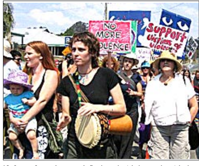
Noisemakers. Last year's Reclaim the Night march in Nimbin.

Reclaim the Night was started by Italian women in Rome in 1976 as a reaction to the increase of sexual assaults in that town and the lack of response to the crimes by the authorities.